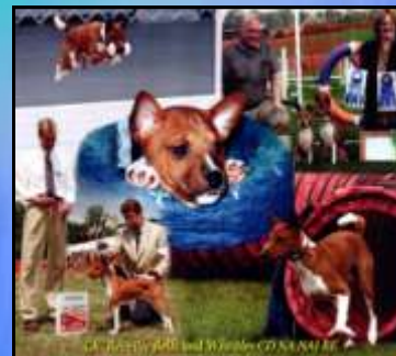
CH Reveille Bells and Whistles Slonaker CD RE NA NAJ NAP