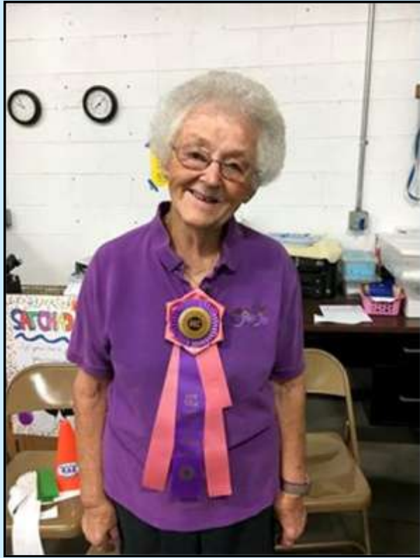
Happy day when Thriller earned his RAE!