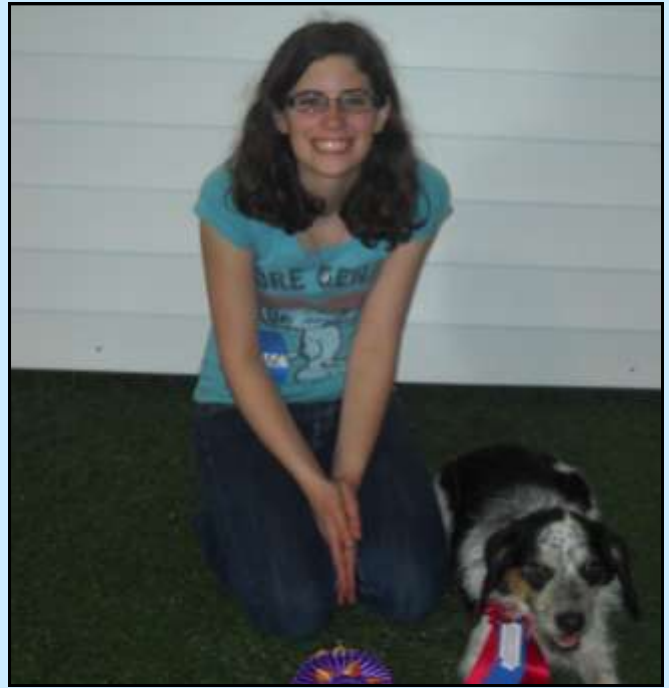
“2013 Agility Trial”