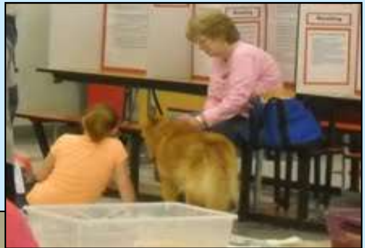
Spring Fling Redbud Run