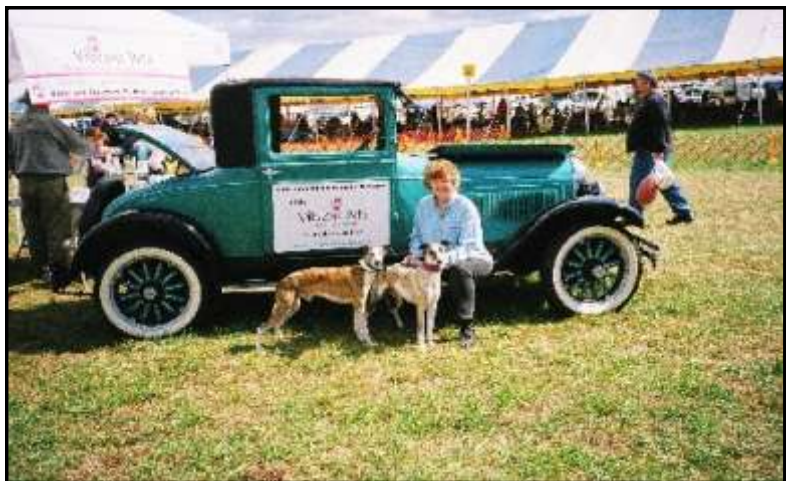
1920's WHIPPET Car. This rare car lives in Berryville, VA

Frederick County Animal Shelter on Sept. 8 will hold a Patriotic Paws Day, or "PP" for short.