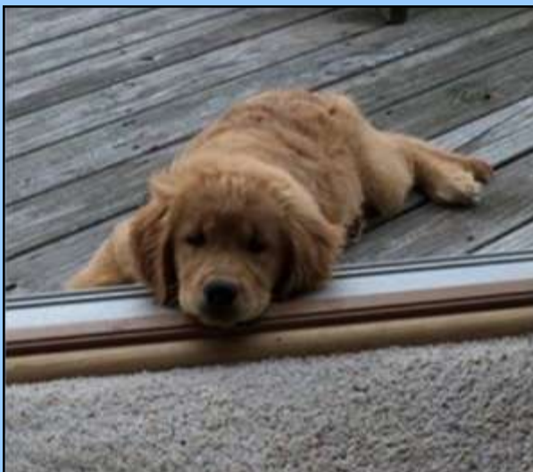
Long day at the Beach