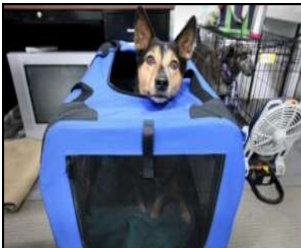
Piper the Australian cattle dog awaits a turn on the agility course.

All dogs must be registered to compete in NADAC-sanctioned events. It does not matter if the dog is a purebred or mixed breed, as long as it is healthy and over 18 months of age.